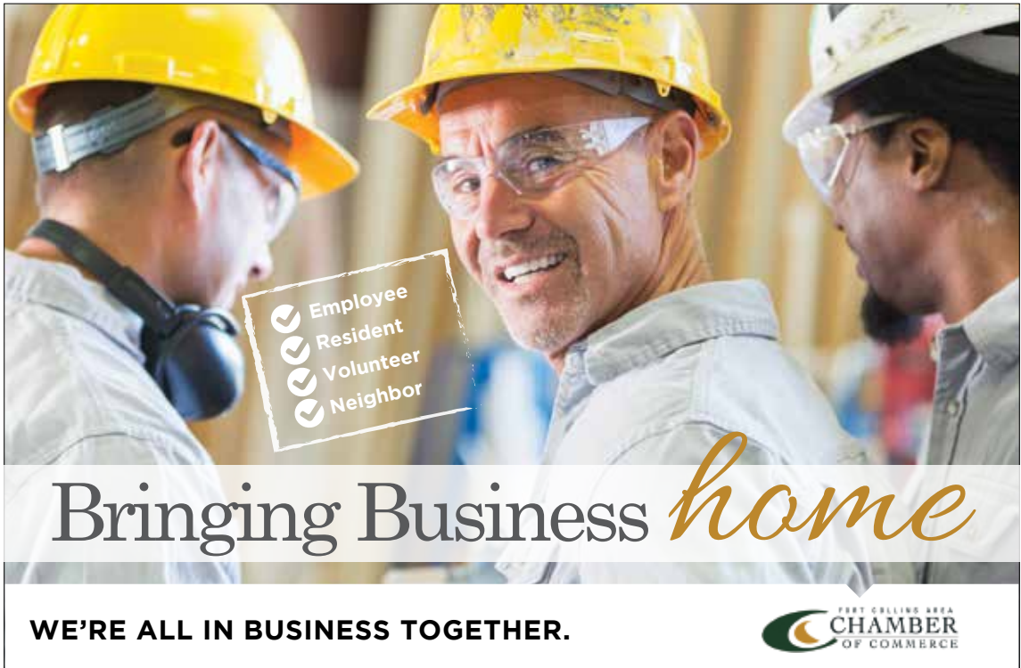
SNEAK PEEK: The Bringing Business Home campaign will launch later this year.

For background: The campaign's first task was to meet with marketing and public relations professionals (including OtterBox, Jet Marketing, FirstBank, and Old Town Media) and gathered ideas, insights, and