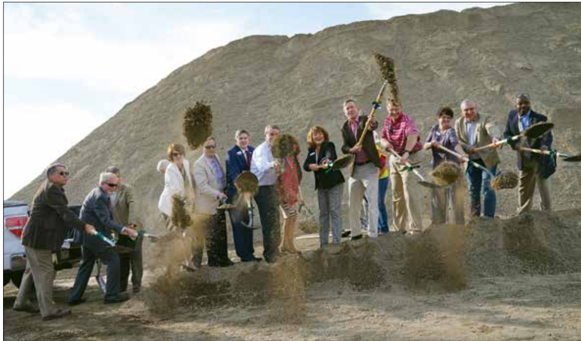
BREAKING GROUND: After a count down from Gov. John Hickenlooper, representatives from all I-25 project partners and distinguished speakers break ground on the North I-25 Express Lanes project on Monday, September 10.

Working alongside the government coalition is the Fix North I-25 Business Alliance, formed under the the Northern Colorado Legislative Alliance (NCLA). It is